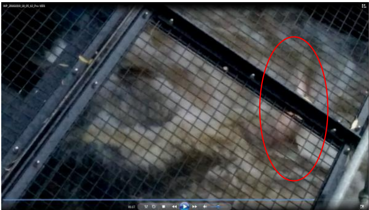
Image 2 VID1: salmon (circled) being flung from top to bottom right of the cage by the turbine blades. 1:17 s into video.