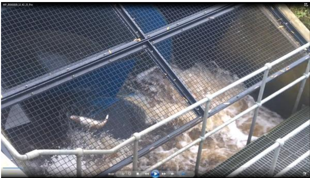
Image 2 VID6: another salmon being tossed into the cages by the trubine blades (00:18s)