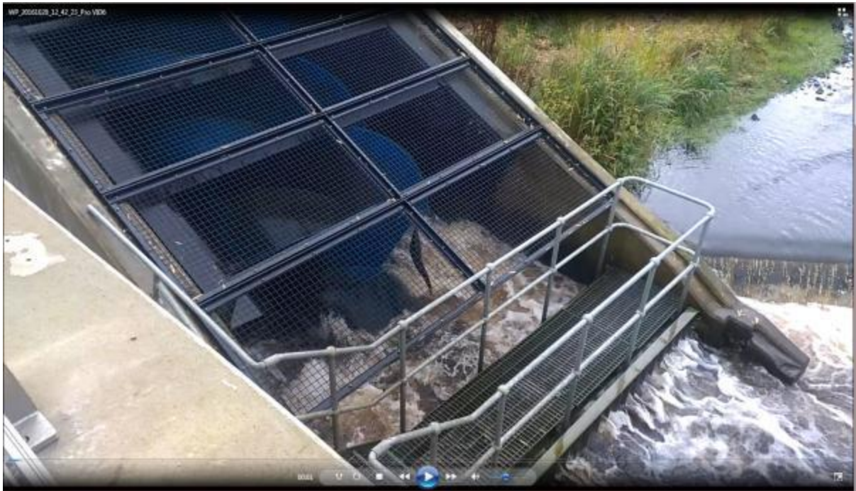
Image1 VID6: a salmon being thrown into the cages by the turbine blade (0:01s)