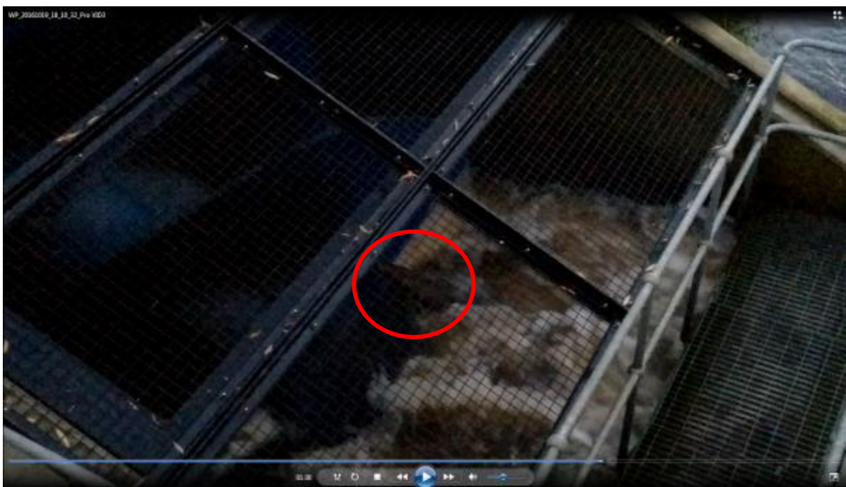
Image 3 VID3: several fish can be seen in the flow directly behind the trailing edge of the turbine blade. (1:30s)