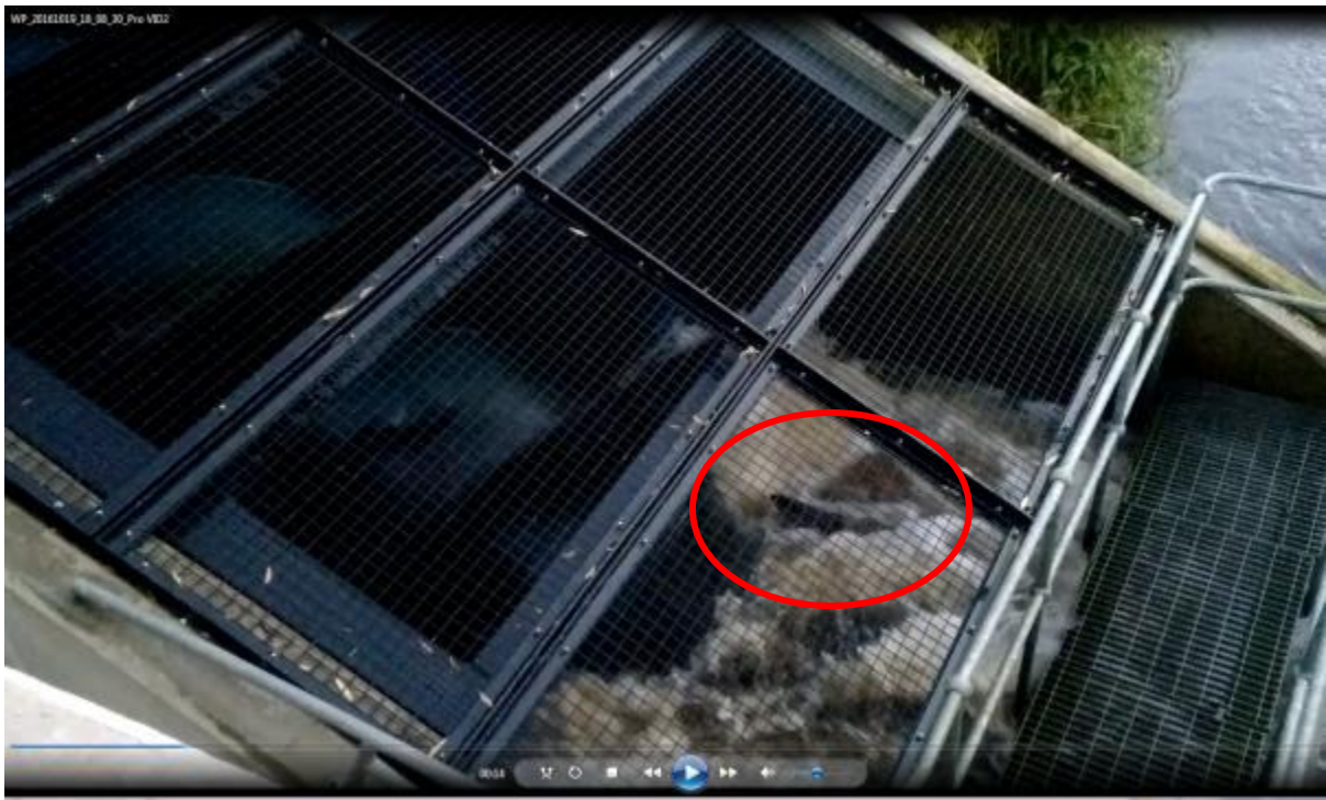
Image 1 VID2 large salmon swimming just behind the turbine blades. (00:14 s)