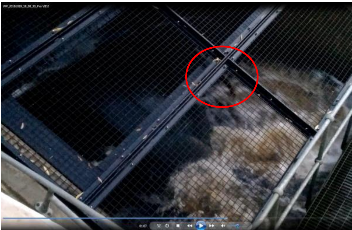
Image 2 VID2: smaller salmon leaps into the turbine and is flung off across the turbine and into the cages.