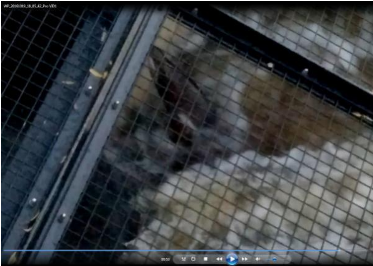
Image 1 VID1: large salmon holding in and around the turbine blade.