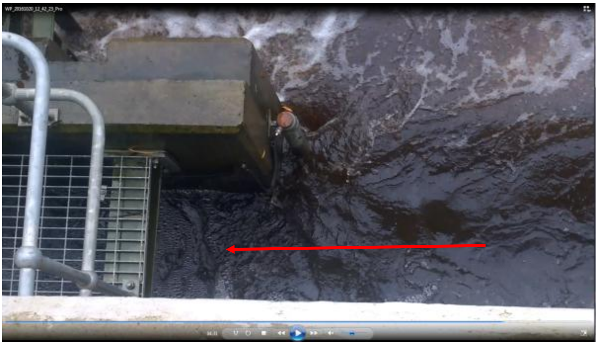
Image 6 VID6: this is the fishpass adjacent to the turbine. There is very little flow and nothing to guide fish away from the turbine to the fish pass