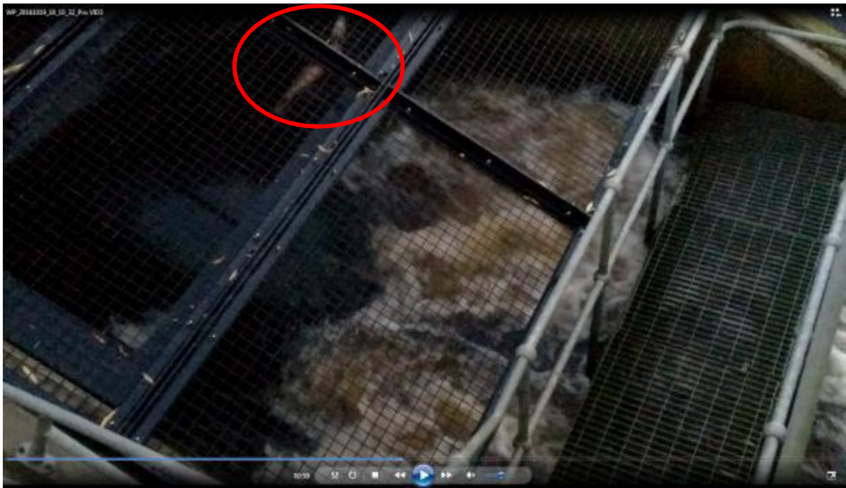
Image 2 VID3: salmon being tossed into the cages by the turbine blade (00:59s)